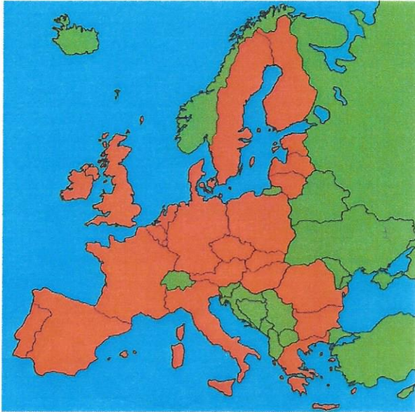
A map of Europe showing members of the European Union.

The EU has its own parliament and its own money which is known as the Euro (€) . Britain is one of a handful of countries in the EU that do not use the Euro as a currency as they have opted out.