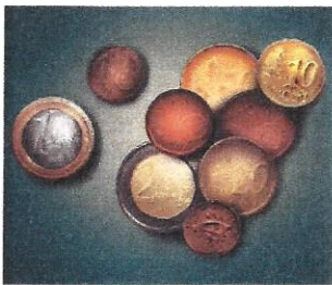
Euro coins that are used in many EU countries as currency.

The European Union has its own flag. There are 12 stars used as it is a number not linked to any particular country for any particular reason. There was not originally 12 members when the flag was agreed on.